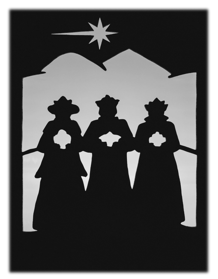
St Martin's www.stmartins-lowmarple.co.uk St Paul's coming soon!